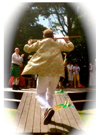
A still Dancing Duke...