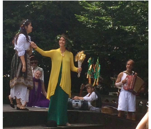
'Jacqueline' de Boys and Hymen...

"It was very beautiful to play there and I was looking at those trees around and asking how it might be to do something similar at home". Sinziana, 5yrs