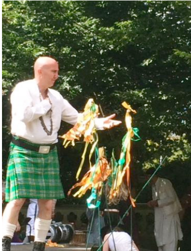
Orlando in action...