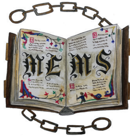
Image of the MEMSlib logo, a medieval book with "MEMS" in blackletter script across it and chains forming a circle above and below, as designed by Ruth Nichols-Pike.

In planning the workshop, I turned to other forms of digital media, bringing together text, pre-recorded video, and